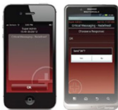
Zipit Confirm iOS & Android Application