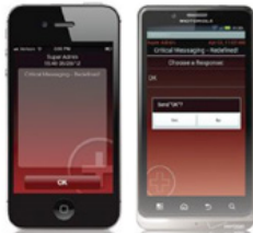
Zipit Confirm iOS & Android Application